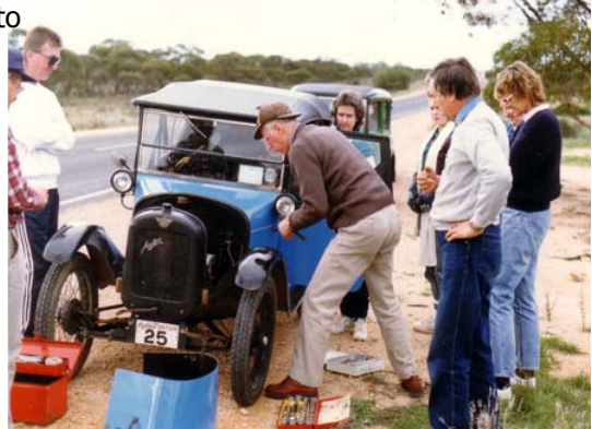
1990 Border Run to Roses Gap, Stawell The A7 Specials assembled for their photo