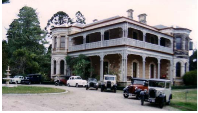
1991 Border Run to Mt Gambier . Cars are at "Yallum Park" Homestead.

SA contingent Hub Rally cars in front of new Parliament House, Canberra, June 1992