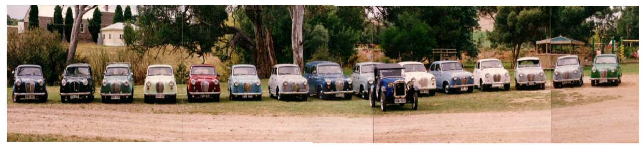
A30's assembled at Angaston, 21-3-93