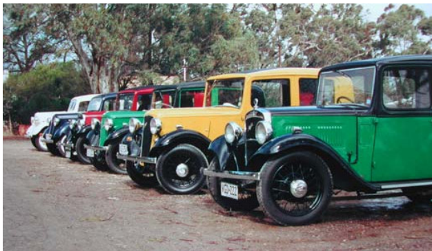
A10's big day out, Meadows, 15-8-93