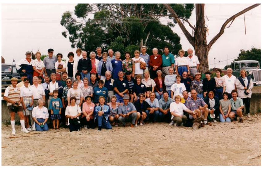
The Tasmanian tour party, March 1995

The growth in membership with new cars and the desire to use them as much as possible, resulted in extra runs being put on at short notice. So the ability to use and enjoy Austin motoring continued to underpin Club membership.