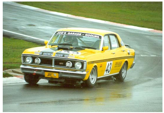
Rob Vanderkamp at the wet September 1997 Mallala Masters meeting.