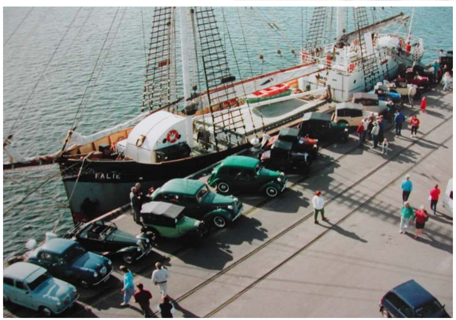
Cars assembled on the wharf at Outer Harbor, alongside the "Falie", after a suburban run in 1993.

Start of the 1993 AGP. Cars of Ayrton Senna (1), Alain Prost (2) and Damon Hill (3).