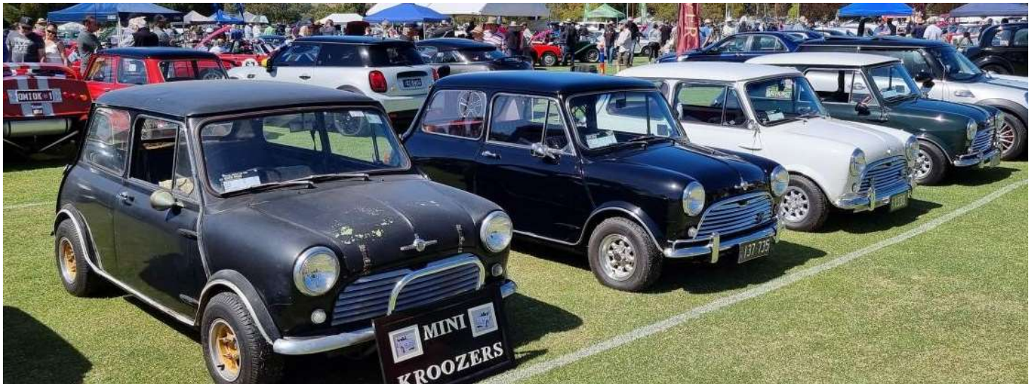
Keith & Wendy Seidel attended the All British Day in their Mini Cooper as found version in the Mini Kroozers display