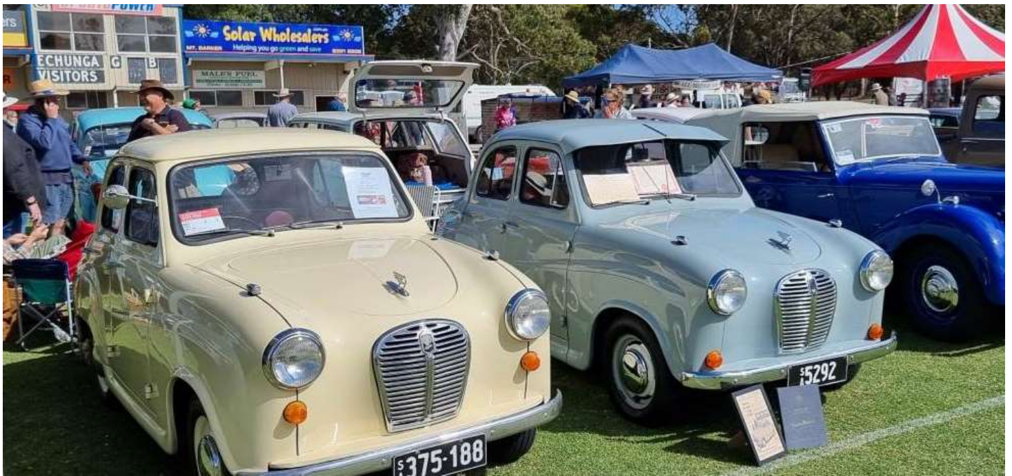
The Spangler family slipped around the edge of the A7 display area because of insufficient room allocated to us, but still had the facility of the marquee to use.