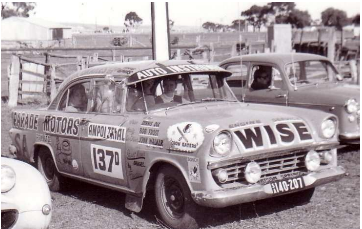
The Parade Motors 1964 Ampol Trial EK Holden entry, at an Austin 7 Club 9 chain sprint event at Gawler Belt prior to participating in the trial. Can anyone identify the girls sitting in the car?